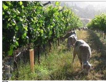
Enlarge Navarro Vineyards

E-mail | Save | Print | Reprints & Permissions | RSS